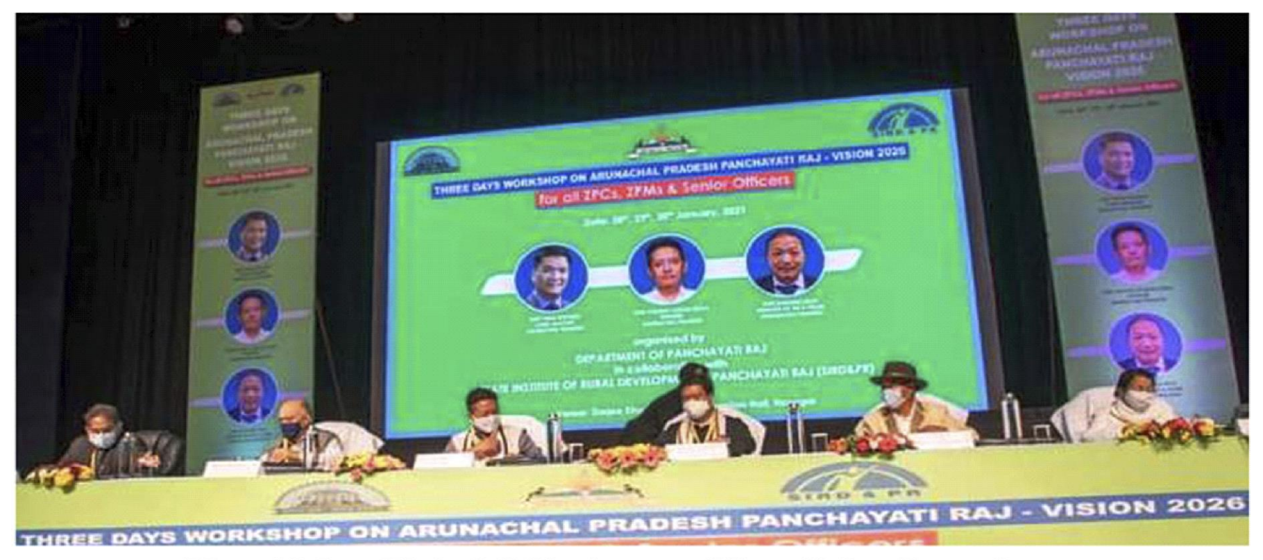
Hon'ble Chief Minister, Hon'ble Speaker, Hon'ble Minister (RD&PR), Hon'ble Advisor (RD&PR) Learned Chief Secretary and Secretary (RD&PR) During inaugural day of three days workshop on Panchayati Raj Rystem in Arunachal Pradesh